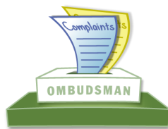
Representatives of long-term care Ombudsman programs